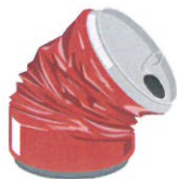
Food and drink cans and foil

These are the ONLY items that should go in the clear recycling sack: