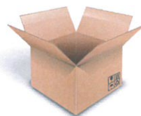
Cardboard - fully inside the sack