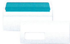
Magazines, newspaper, paper incl. envelopes with windows