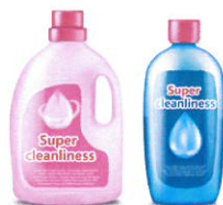
Plastic bottles and plastic food containers